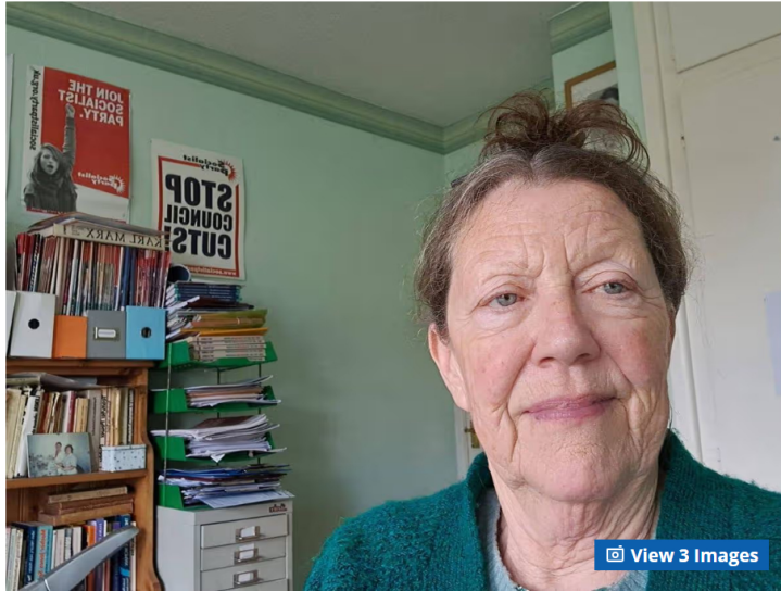
View 3 Images